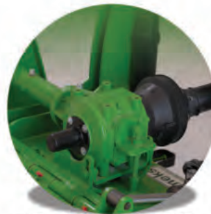
- Italian-designed transmission-