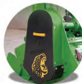
- Six-belt drive system-