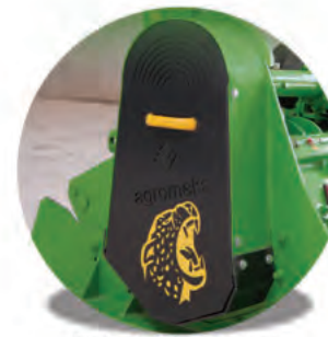
- Six-belt drive system-