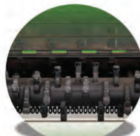
-Carbide Diamond Crusher Rotor-