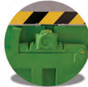
- Springless articulated drum bearing system-