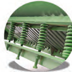
- Spring Screening System-