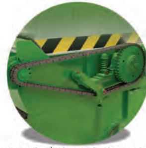
-Automatic chain tensioning system-