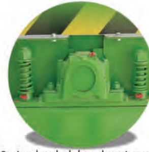
-Spring-loaded drum bearing system-