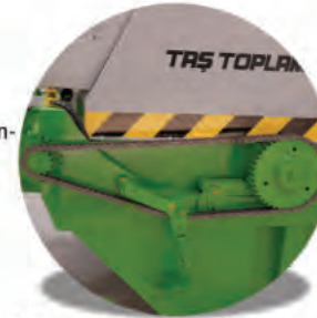
-Automatic chain tensioning system-